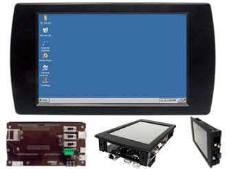
TSD-31C, TSD-32C, TSD-43C